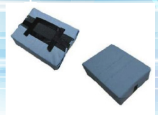
Energy Absorber Before Impact