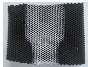
Energy Absorber Post Impact

The leg is struck with an 8.1 kg linear guided impactor with a honeycomb face fired at 11.1 m/s (40 KPH). The "FLEX-PLI" energy absorbers are supplied as pre-cut blocks according to the testing requirements.